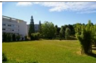
Campus de Cachan

The residence hall CROUS Cachan Campus is located at about 45 minutes by bus from ESIEA Paris- Ivry Campus. Please note that there is no cooking facilities but there are university restaurant facilities nearby.